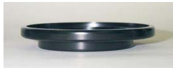
GD series 2003-2004 spring seat adaptor