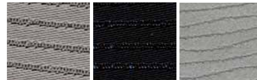
Aurora Platinum Cloth (APC) Aurora Black Cloth (ABC) Platinum Dune Cloth (PDC)