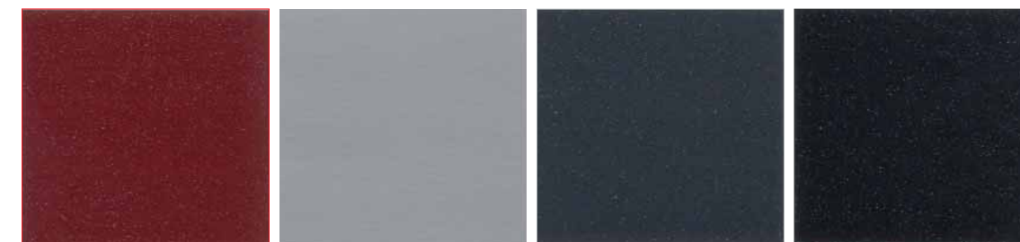
Camellia Red Pearl Steel Silver Metallic Dark Gray Metallic Obsidian Black Pearl